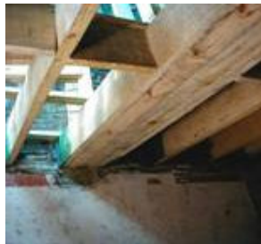
New Timber Spine Beam