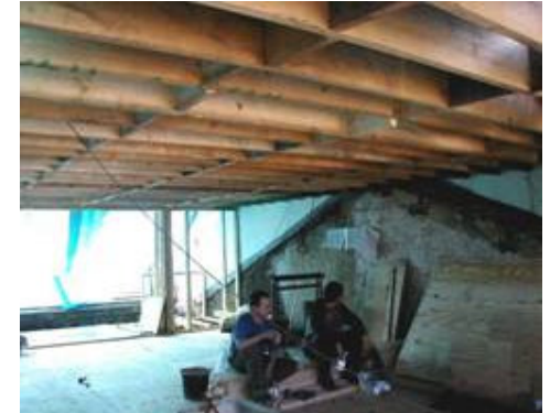
5th Floor During Construction (Note Profile of Old Roof in Background)