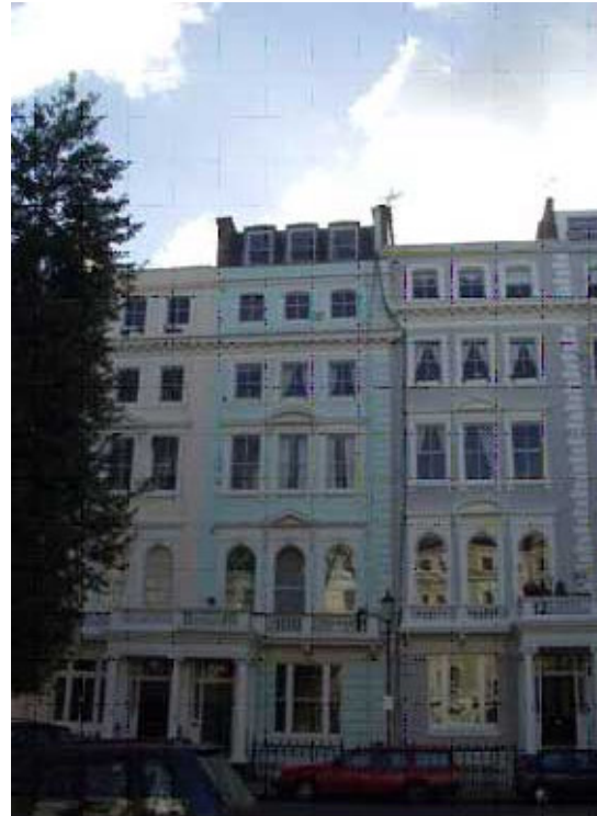
External Elevation Showing New Dormer Windows