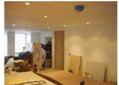
Completed 5th Floor