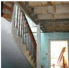
New Joists at 5th Floor