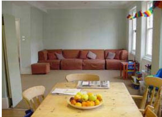
New Open Plan Dining / Living Area