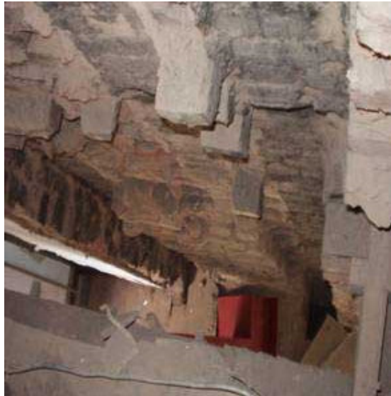
Removal of Existing Chimney Stacks