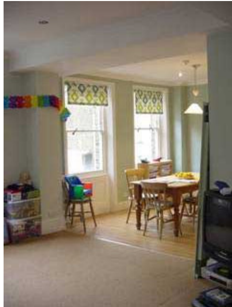
Completed Second Floor Opening