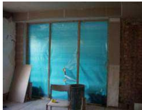
Second Floor Opening Under Construction